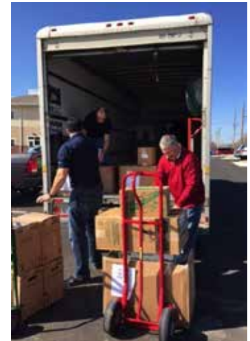
Unloading residents' belongings at their new Home.