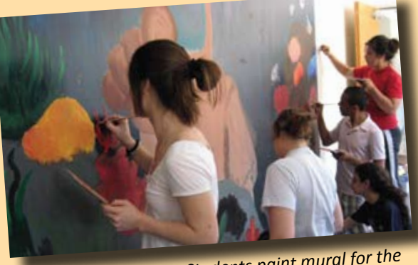
East High School Art Students paint mural for the Home.