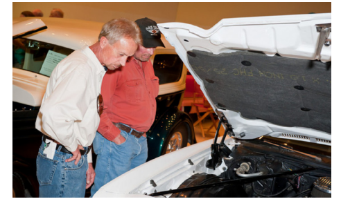
Dozens of classic cars will be on view to be admired by attendees at Classic Cars for Kids April 5.