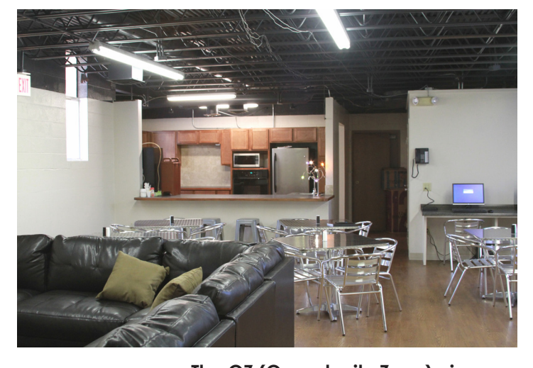
The OZ (Opportunity Zone) gives homeless youth a safe place to snack, study, shower and connect with services as an extension of the WCH street outreach.

Currently, The OZ is open Monday and Wednesday from Noon to 6 p.m. and on Thursdays from 3 to 9 p.m.