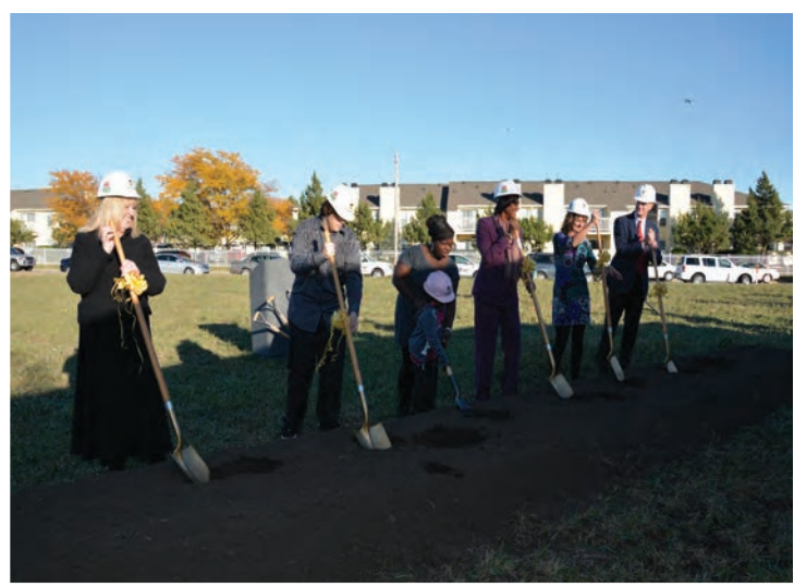
Wichita Children's Home breaks ground for the new building on Nov. 7, 2013.