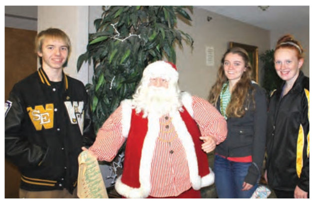
Band students from Wichita High School Southeast stopped by to present a donation to the WCH which they had raised in memory of a former classmate who was also a resident of WCH.

April is National Volunteer Appreciation Month, and we appreciate all that our volunteers do for the children all year long.