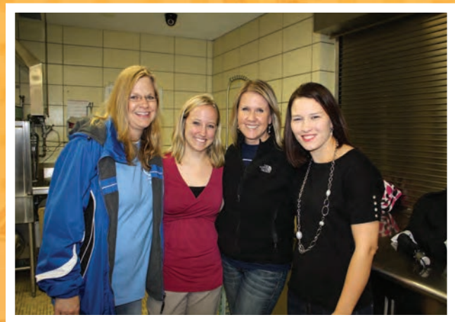
Employees of IMA hosted a cookout for our residential children and BRIDGES youth. We thank IMA for their volunteer and financial support during the year.